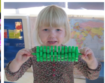
Selma's Tet watermelon